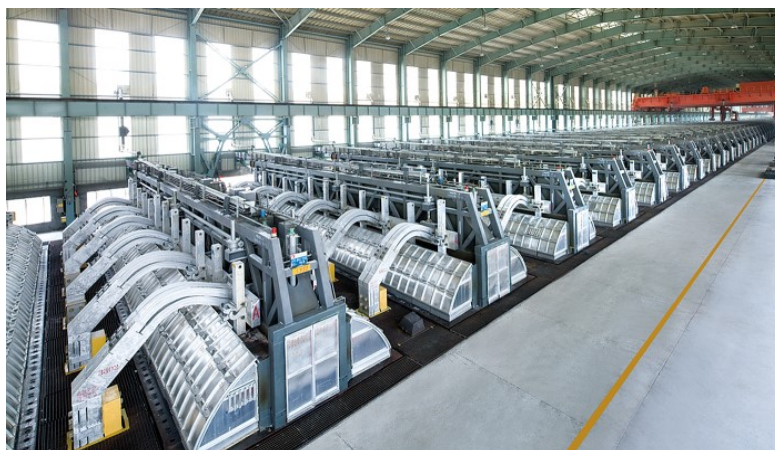
Figure 2. Shandong Weiqiao’s 600 kA Aluminium Electrolysis Potline.